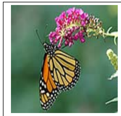
Monarch on Milkweed