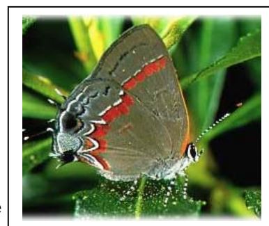
Red Banded Hairstreak