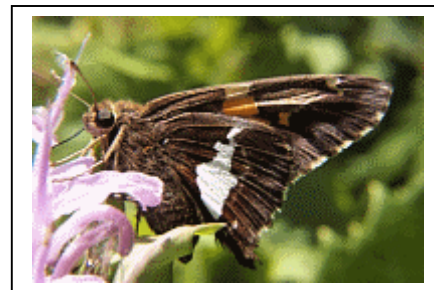
Silver Spotted Skipper